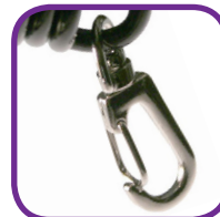
Swivel Loop Hook