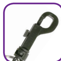
Plastic Swivel Hook