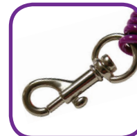
Swivel Snap Hook