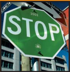
What would you do if you came to this sign? Stop or go?

Color plays an important role in the world. It can change minds and cause all kinds of reactions. Color can raise your blood pressure, make your mouth water or