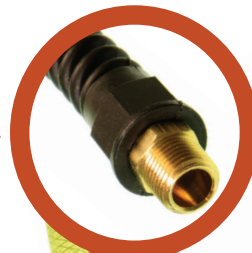
Rigid Fitting with Strain Relief

* In addition to color choice, select fittings for both ends of the coil.